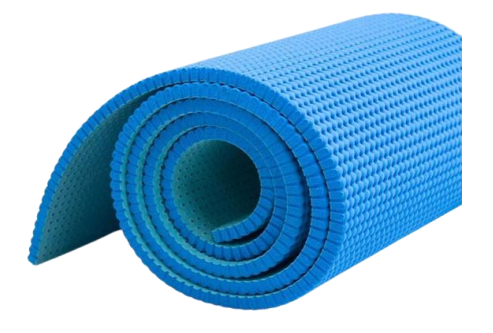
27-33 shore A (hard)