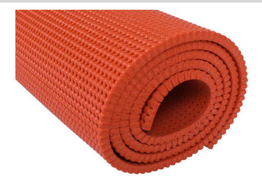
Mainly used on vacuum ironing table and steam press machine.