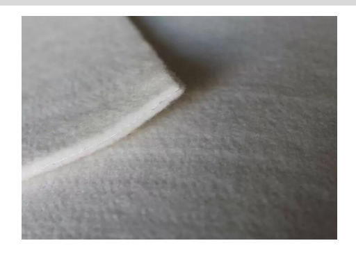
NO-350 Aramid Felt