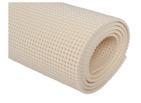
15-21 shore A (medium)